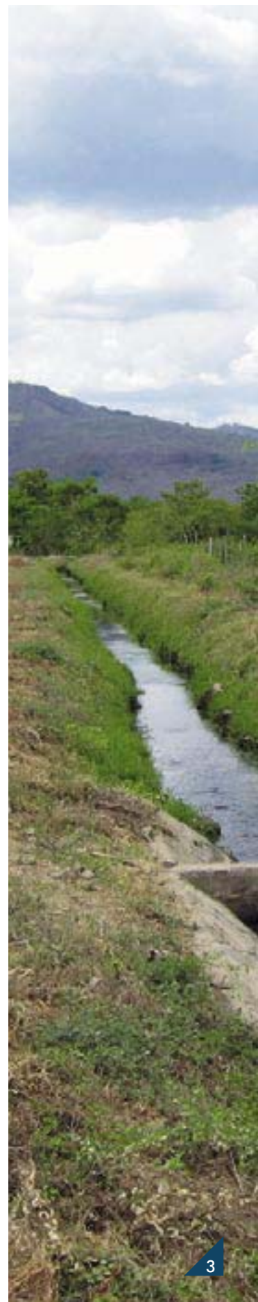
Irrigation channel in Central America

For project implementation, several of the six inter-linked dimensions usually need to be considered: environment, economy, social issues, institutional set-up, technology and knowledge. These transversal aspects of water form important interfaces with other policy areas such as health, education, agriculture etc.