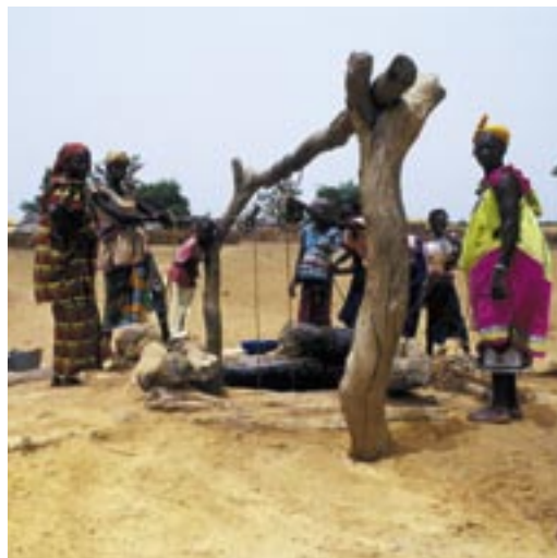
Retention basin for supplementary irrigation and groundwater recharge

Focal points of SDC's strategy are the increase in water use efficiency and the local responsibility and control of the management of the systems. To increase water productivity, SDC promotes the strategy of "more crop and jobs per drop". SDC's involvement is primarily in semi-arid and arid regions where rainfed farming and soil moisture conservation are supported. This includes small-scale irrigation with locally adapted, demand-oriented technologies which are affordable for small farmers and which are integrated in the overall livelihood system. SDC also promotes innovative approaches in agricultural research and supports education, training and strengthening of water user-groups.