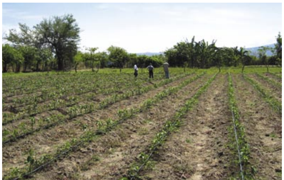
Drip irrigation in Central America

The Team is the focal point for technical questions, it is responsible for coordination with other federal authorities and SDC’s position in multilateral discussions within the Interdepartmental Sustainable Development Committee (ISDC) for Water. The IWRM Team is also in charge of technical advice and support for programmes and partners, and of institutional networking and institutional learning on the water and development topic.